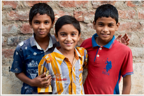
These boys live at Berachah Children's Home in Machilipatnam, India.

To be a platform that serves like-minded partners as they offer life-changing opportunities to suffering children and at-risk families around the world.